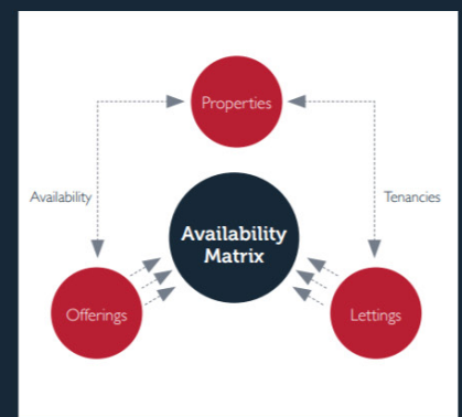
Figure 3 - The Availability Matrix