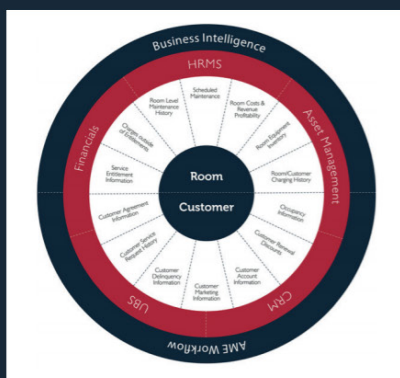
Figure 1 - Room and Customer Solution

With the potential future introduction of reactive maintenance, Claremont will have provided a solution capable of booking, managing, maintaining and analysing Unite Students' complete property portfolio allowing them to significantly differentiate themselves from their competitors.